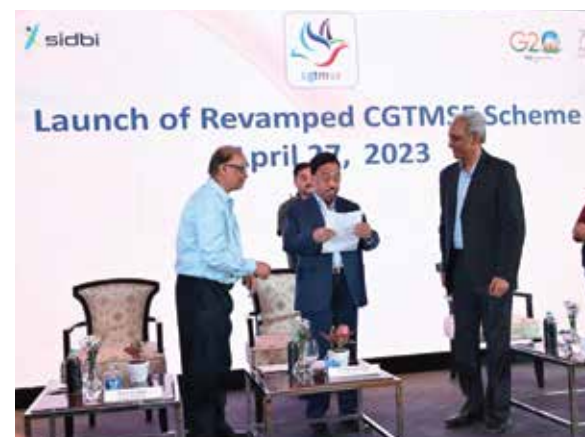
Launch of Revamped CGTMSE Scheme on April 27, 2023